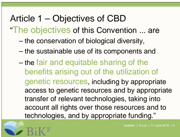
Fig. 2: Article 1 of the Convention on Biological Diversity

One of the three objectives of the CBD is the “ fair and equitable sharing of the benefits arising out of the utilization of genetic resources ” (figure 2). The aim is to find transparent ways for balancing the interest of those communities who traditionally use these resources and those states and enterprises who want to use them commercially. The most important requirements for such regulations are transparency, legal certainty and non-discrimination. Access and Benefit Sharing (ABS) is currently one of the most contested issues of the CBD. It is high on the agenda for Nagoya in Oct 2010.