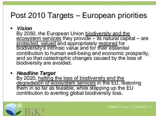
Fig. 3: Post 2010 Biodiversity Targets – European priorities

them as far as feasible, while stepping up the EU contribution to averting global biodiversity loss (figure 3).